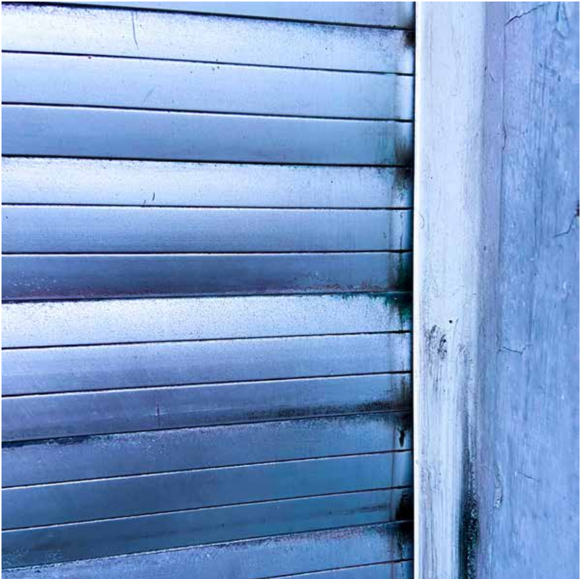
Downtown, Vancouver, BC