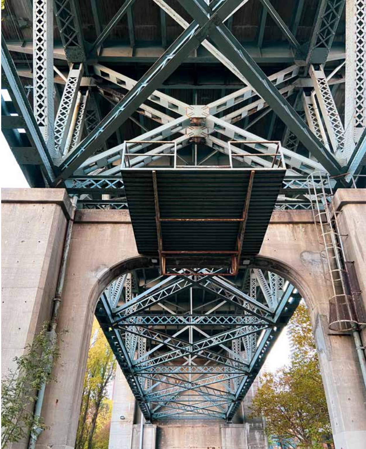
Burrard Bridge, Vancouver, BC >