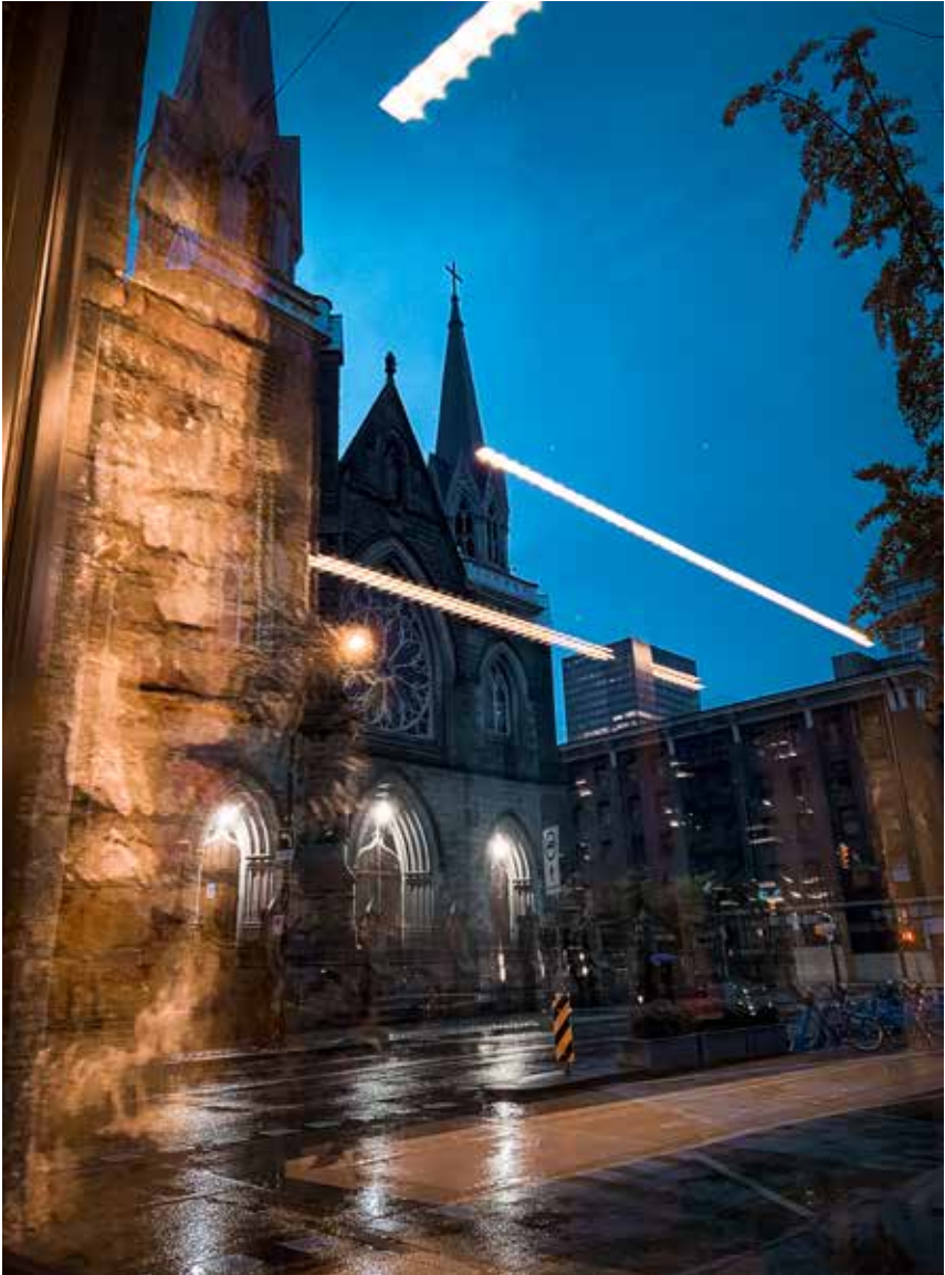
Cathedral Square, Vancouver, BC