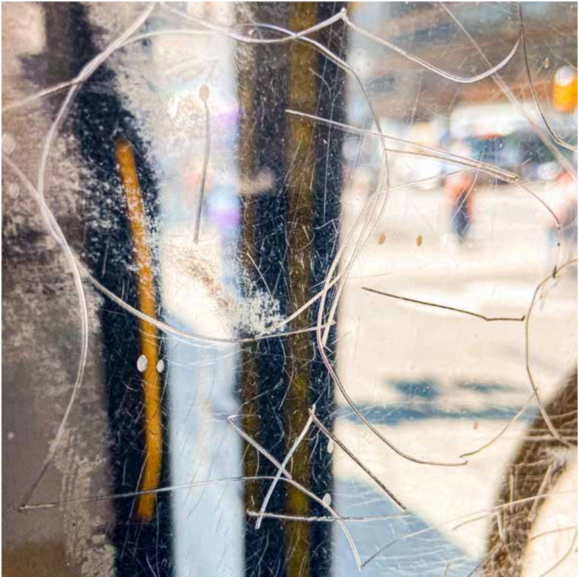
Granville Street, Vancouver, BC