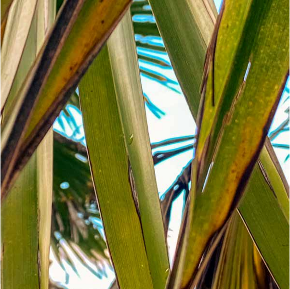
Sunset Beach, Vancouver, BC