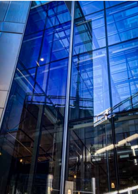
Vancouver House, Vancouver, BC