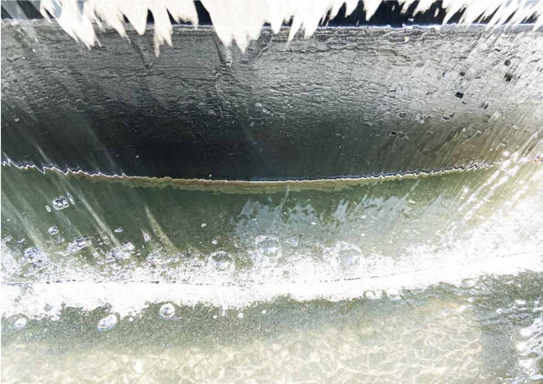
Stanley Park, Vancouver, BC