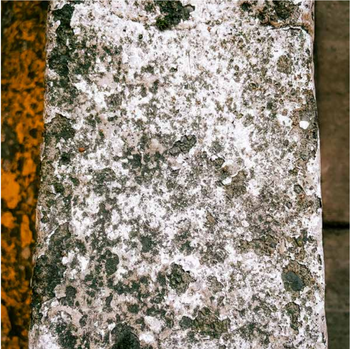
Downtownna, Vancouver, BC