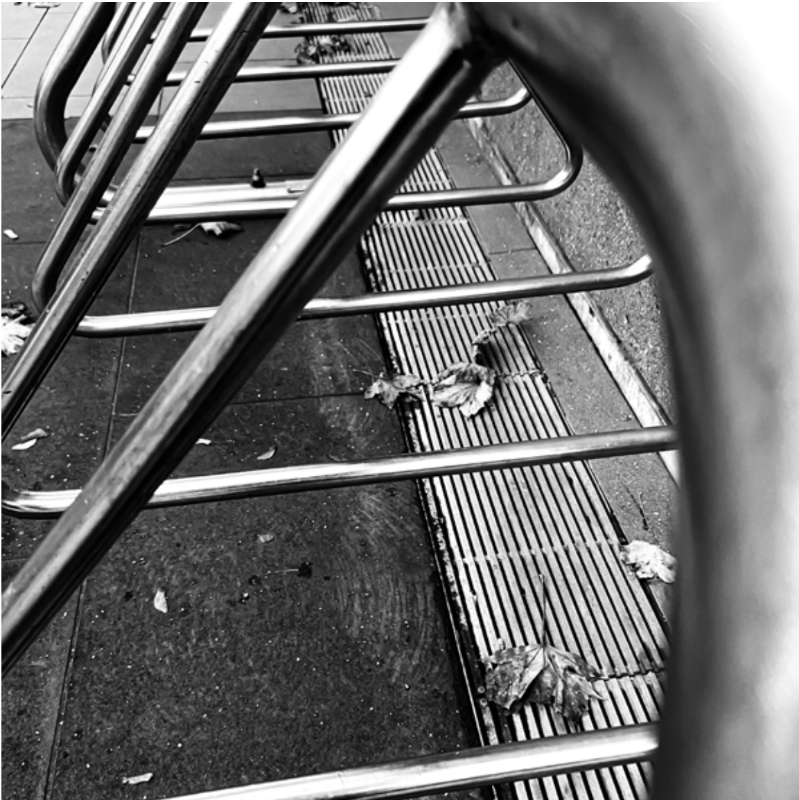
Richards Street, Vancouver, BC