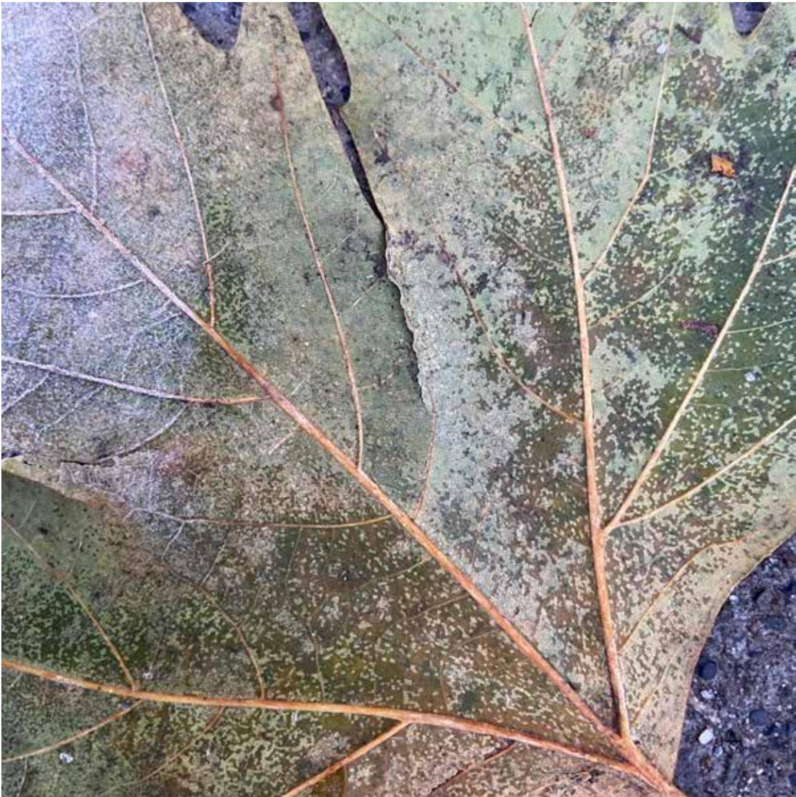
Front + Back Covers | Granville Island, Vancouver, BC