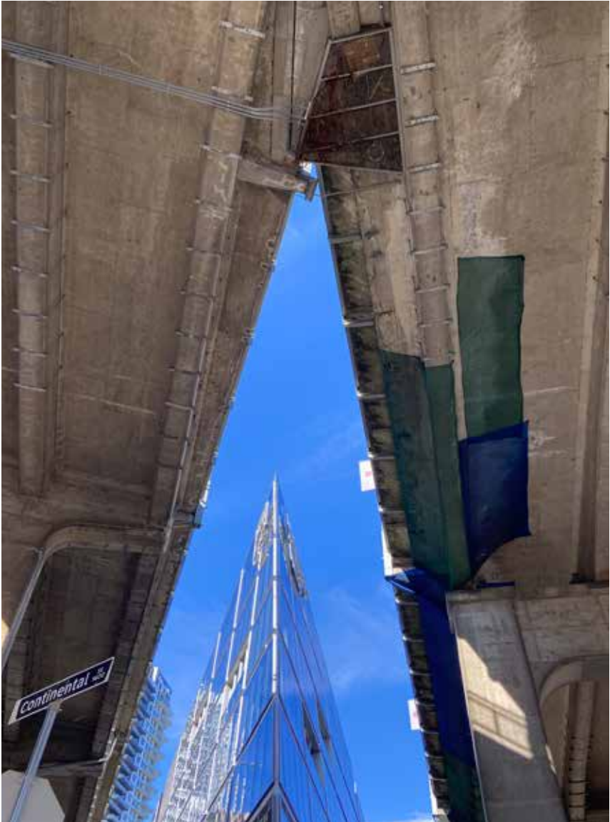
Vancouver House, Vancouver, BC