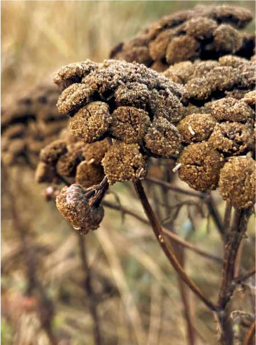
Sunset Beach, Vancouver, BC