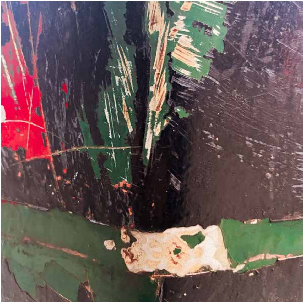
Downtown, Vancouver, BC